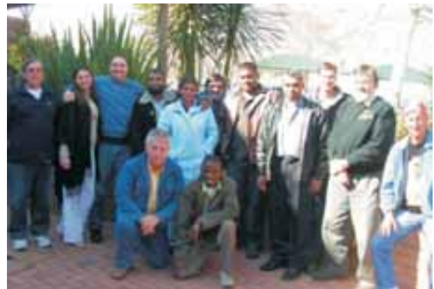
Staff from Durban and Joburg at a sales conference held at Harrismith. Well worth the effort!!