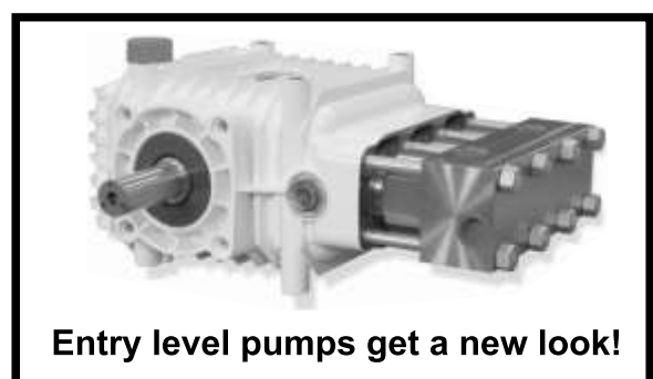
Entry level pumps get a new look!

The "R" in MLR and RLR signifies that there are 1500rpm and 1800rpm versions available.