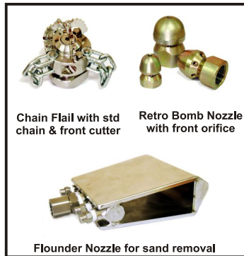
Chain Flail with std chain & front cutter

Each pump is supplied with a 10m hose, gun and reversible spray tip. An LCD display allows for easy and accurate pressure regulation.