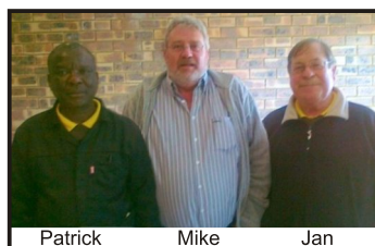
Patrick Mike Jan

The hose guide can be positioned upright (for when the reel is suspended from an overhead beam), and four positions either side, giving a total of nine guide positions.